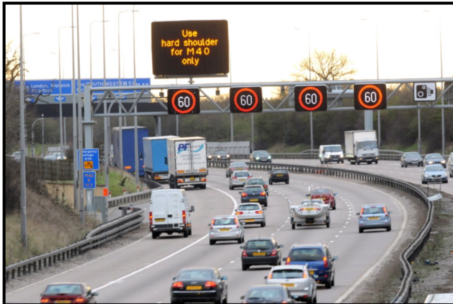
Figure 3: Hard shoulder running

Once smooth flow is established and the hard shoulder has been checked for obstructions, the hard shoulder is then opened to traffic. This is indicated by the display of a speed limit over the hard shoulder, coupled with the display of speed limits over all other lanes (consistent with the Highways Agency's "all-on all-off signalling policy").