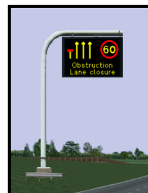
Figure 6: Verge mounted signalling arrangement