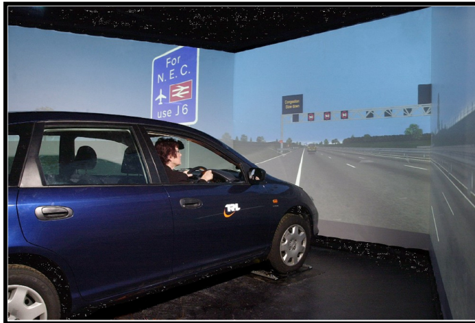
Figure 7 – Participant in the driving simulator study