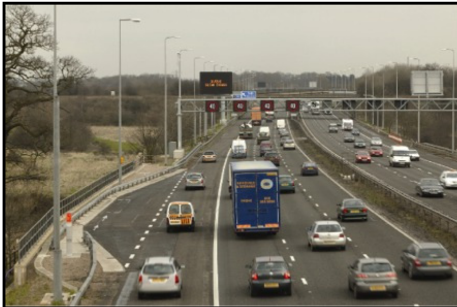
Figure 1: Dynamic Hard Shoulder with Emergency Refuge Area

The initial smart motorway design added extra capacity by opening the hard shoulder to traffic during periods of heavy traffic demand (a concept known as 'dynamic hard shoulder running' or DHS).