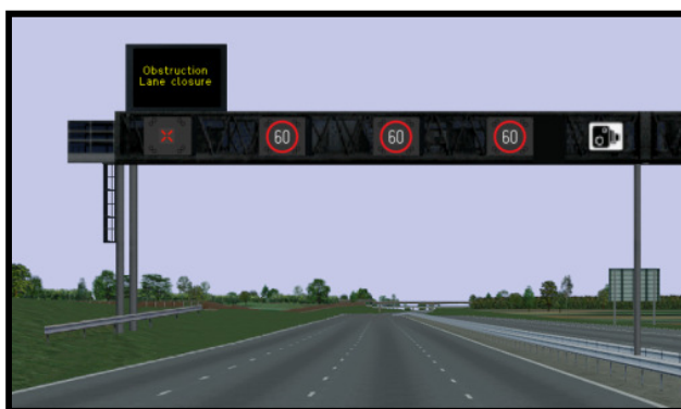
Figure 5: Gantry mounted signalling arrangement

Eliminating the dynamic hard shoulder element will serve to reduce any potential confusion over whether or not it is available as a running lane at a particular time, and will therefore eradicate hard shoulder abuse/misuse within the scheme (since there will no longer be a hard shoulder).