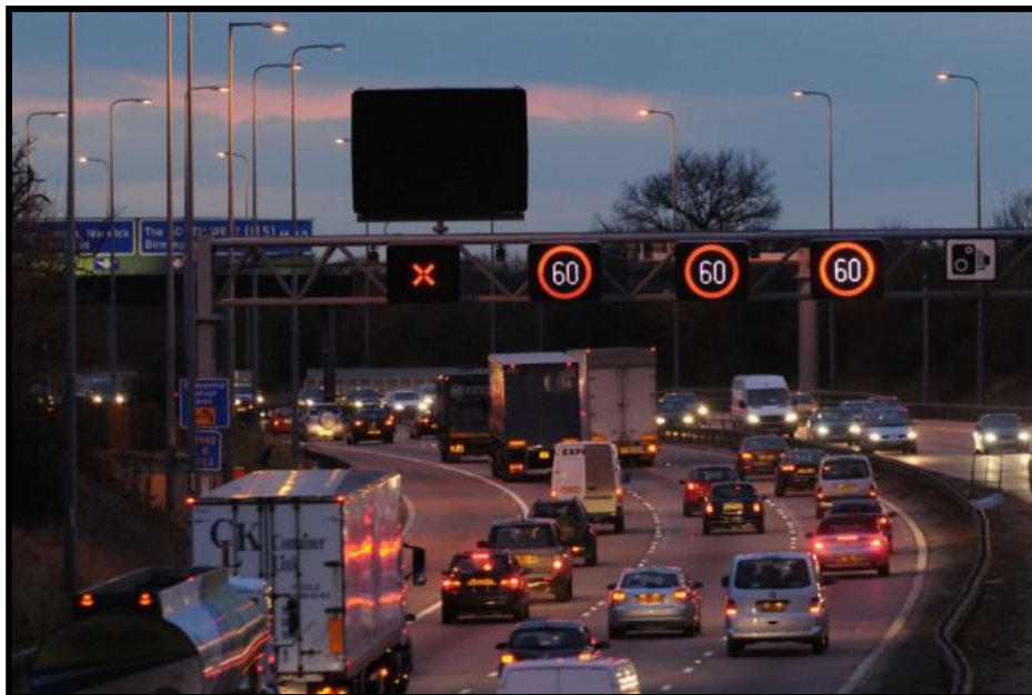
Figure 2: Conditioning phase

Before the hard shoulder is opened, the highway is “conditioned”, a phase during which the speed limit is reduced to 60 mph in an effort to establish smooth traffic flow.