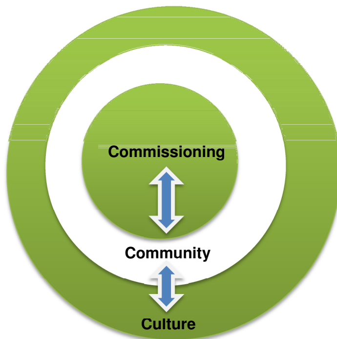
Diagram 1: Spheres of influence

The next sphere of influence SSRP has is in the Community. Communities need to contribute to the commissioning process – communities help to shape and influence the desired outcomes and are affected by the results of the outcomes.