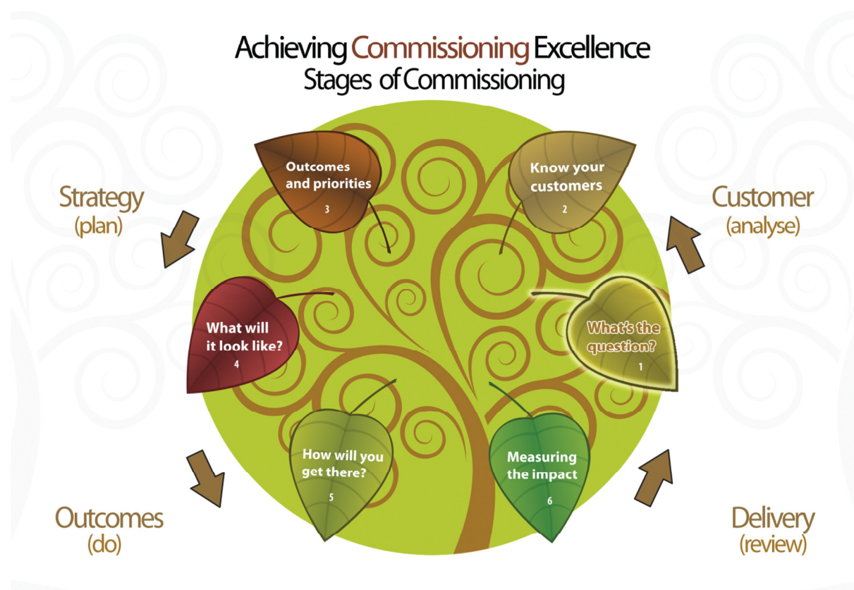
Diagram 2: The 6 Stages of Commissioning

What mechanism will be needed to deliver the outcomes? Are partnerships required? Are different structures required?