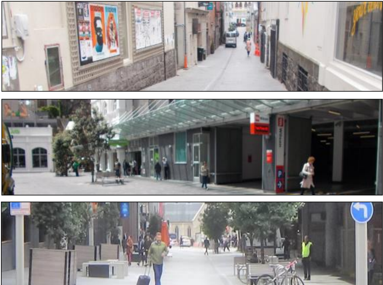
Figure 5: Inactive Building Frontage: Fort Lane, Fort St (east), and Federal St