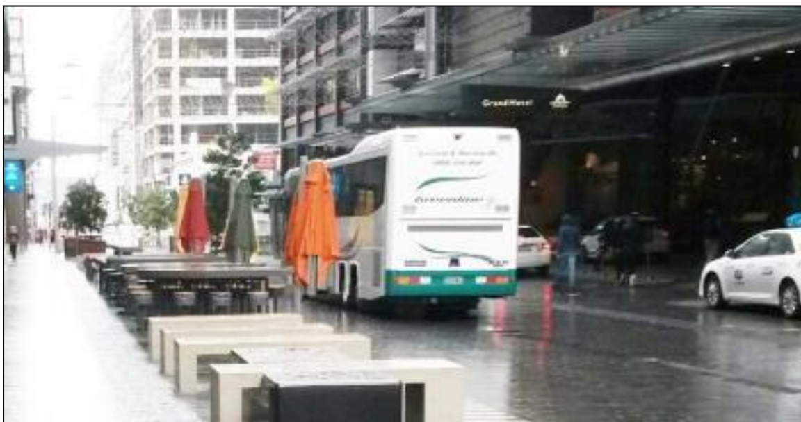
Figure 11: Federal Street – Frequent Buses

Federal Street recorded a fairly high proportion of large vehicles (7%), and since traffic volumes on Federal Street are relatively high (3,444 veh/day), this result is considered significant. In particular, large numbers of buses were observed using the Shared Space, usually associated with the Sky City Hotel/Casino. The high proportion of large vehicles using Federal Street is considered to contribute to Federal Street operating less successfully as a Shared Space.