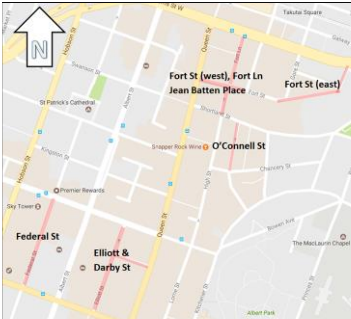
Figure 1: Location and Layout of Auckland CBD Shared Spaces

The location and layout of the subject Shared Spaces are illustrated in Figure 1.