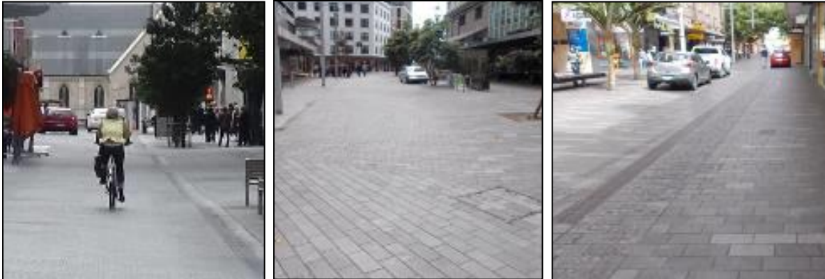
Figure 8: Insufficient ‘side friction’ – Federal Street, Fort Street (east), and Darby Street

Circulation zone ‘side friction’ encourages slower vehicle speeds. ‘Side friction’ is increased by having a narrow circulation zone with permanent street furniture of sufficient height and bulk positioned close to the circulation zone. Several Shared Spaces (Fort Street (east), Federal Street, Darby Street, Elliott Street, and O’Connell Street) appear to generate insufficient ‘side friction’, which is likely to be an aggravating factor with respect to higher vehicle speeds on these Shared Spaces.