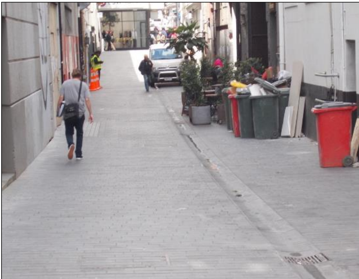
Figure 3: Fort Lane – Lack of Accessible / Activity Zones

Fort Lane does not provide an accessible zone or an activity zone. These zones were not incorporated into this Shared Space due to the lane's narrow width (5m). As a result of not including these zones, it is questionable whether Fort Lane is accurately defined as a Shared Space, as it effectively operates as a service lane. Pedestrian safety and amenity is likely to be compromised on Fort Lane by lack of provision for the zones. Consideration could be given to increasing amenity for pedestrians along the lane by providing some form of activity zone, with a 'buffer' between pedestrian and vehicles. However, pedestrian volumes and vehicle speeds are low along the lane, and the lane appears to have a satisfactory safety record.