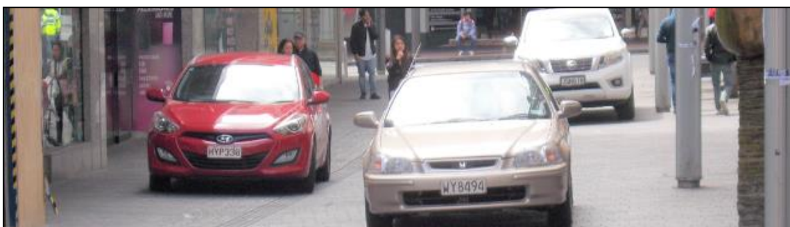
Figure 4: Darby Street – Lack of Accessible / Activity Zones on Northern Side

Darby Street could be an ideal Shared Space to undertake a trial for closing a Shared Space to traffic after 11am. This is because it has no driveway accesses, has low traffic volumes, and its closure would not create a significant detour. Electronic bollards could close-off the Queen Street entrance at 11am, after which loading is no longer permitted. Any vehicles remaining in Darby Street after 11am could exit the Shared Space using Elliott Street. Furthermore, if closing Darby Street was successfully trialled, then consideration could be given to closing some other Shared Spaces, such as Jean Batten Place and O'Connell Street.