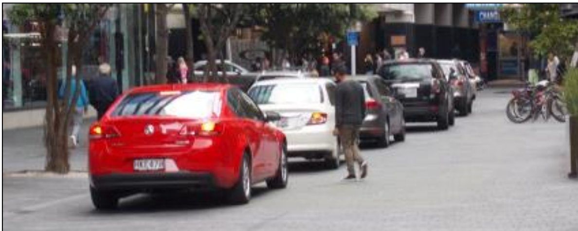
Figure 9: Fort Street (west) - Pedestrian Crossing Through Vehicle Queue

All the other Shared Spaces had similar levels of motorists yielding to pedestrians (ranging from 35% to 44%), with the exact figures not being considered significant.