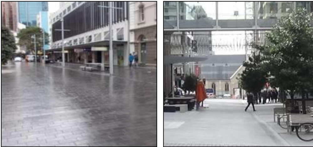
Figure 6: No Lateral Shift Circulation Zone – Fort St (east) and Federal St

Circulation zone lateral shift is effective at moderating vehicle speeds, and based on international research straight sections of Shared Space should be limited to around 50m lengths. None of the Shared Spaces have been provided with lateral shift, which is considered a significant design flaw, particularly in relation to Shared Spaces with long midblock lengths and wide circulation zones. Both Fort Street (east) and Federal Street have no lateral shift, and are long, straight and wide. It is no coincidence that these Shared Spaces both exhibit excessive vehicle speeds (85 th percentile speeds of 24km/h and 26km/h, respectively). Consideration should be given to introducing lateral shift to these Shared Spaces, and any other Shared Spaces with a vehicle speeding issue.