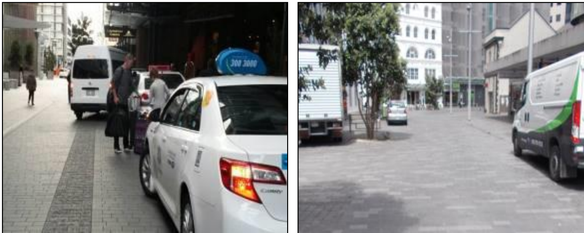
Figure 12: Federal St (L) and Fort St (east) (R) – Illegal Loading / Parking

Measures should be considered to reduce illegal loading/parking, such as (i) increased enforcement; (ii) increased signage; and (iii) extended time periods for legal loading.