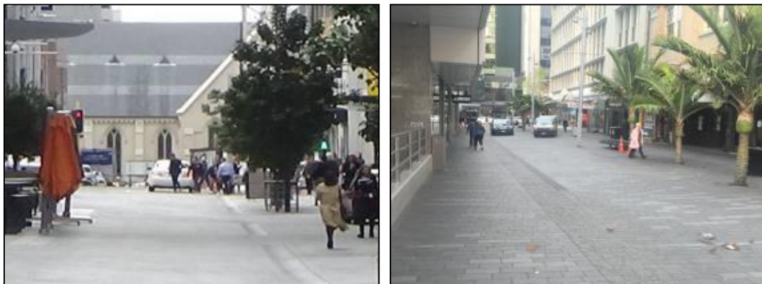
Figure 10: Federal Street (L) (crossing quickly), and Darby Street (R) (wandering across)

Also, both Darby Street and Jean Batten Place had low percentages of pedestrians crossing the Shared Space. However, in reality, it is considered likely that most pedestrians using these Shared Spaces crossed the space, and that many pedestrians were not counted as 'crossing' because they meandered across the space, or they crossed in the vicinity of the Shared Space junction (Elliott Street / Fort Street (west)), both of which are not negative aspects.